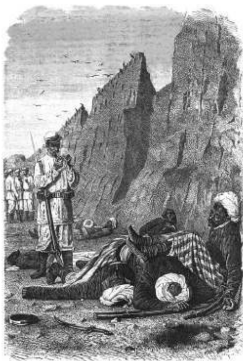
Vasilij Vereshchagin. After Defeat, 1868.