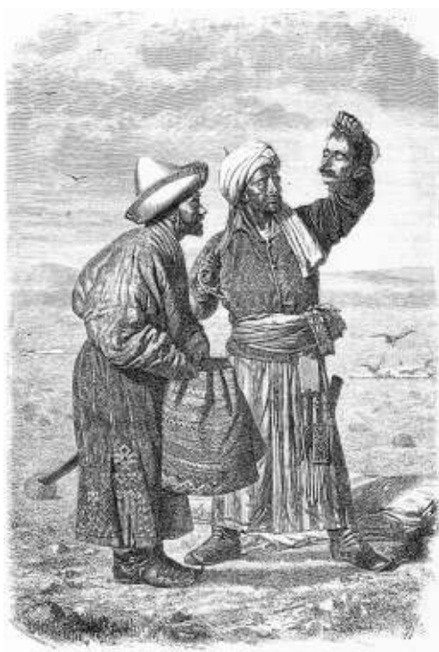
Vasilij Vereshchagin. After Victory, 1868.