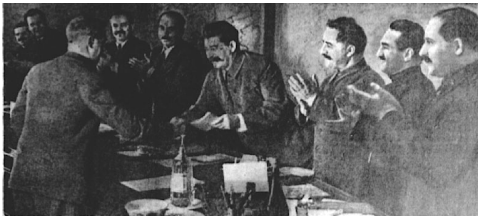
Annexe n° 12