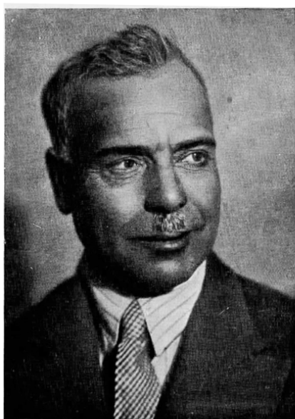
Annexe n° 13