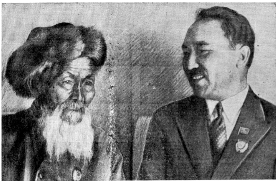
Постановлением Центрального Исполнительного Комитета Союза ССР (26 мая 1938 г.) Народный певец Казахской АССР тов. Джамбул Джабаев и писатель Сакен Сейфуллин награждены орденами Трудового Красного Знамени. На фото: народный певец Джамбул Джабаев и писатель Сакен Сейфуллин